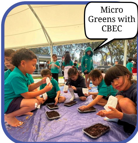
Micro Greens with CBEC