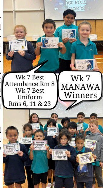
Wk 7 Best Attendance Rm 8 Wk 7 Best Uniform Rms 6, 11 & 23