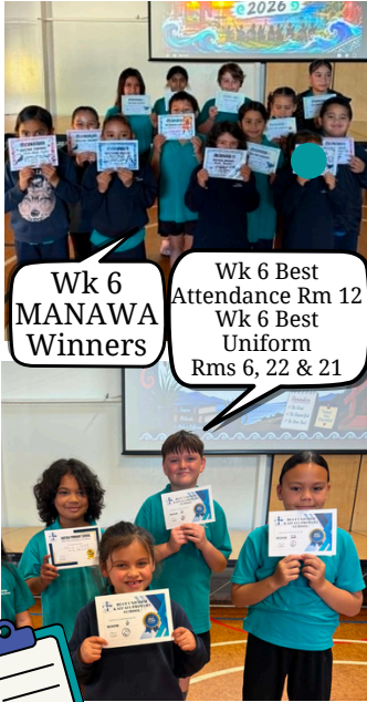
Wk 6 MANAWA Winners