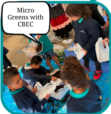
Micro Greens with CBEC