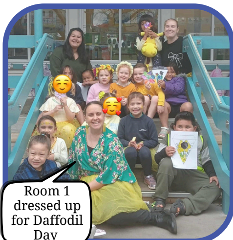
Room 1 dressed up for Daffodil Day