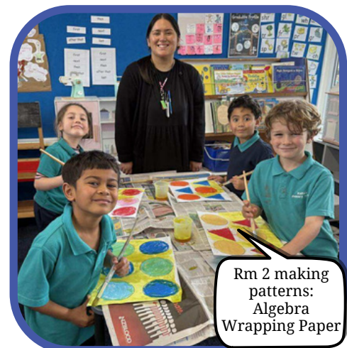
Rm 2 making patterns: Algebra Wrapping Paper