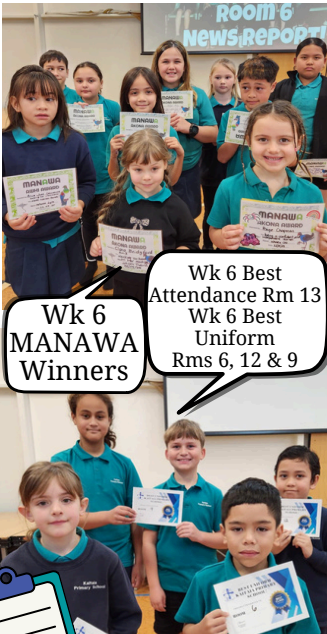
Wk 6 MANAWA Winners

Wk 6 Best Attendance Rm 13 Wk 6 Best Uniform Rms 6, 12 & 9