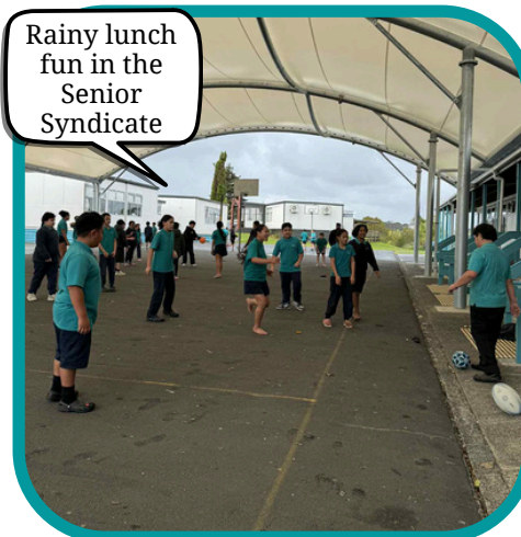
Rainy lunch fun in the Senior Syndicate