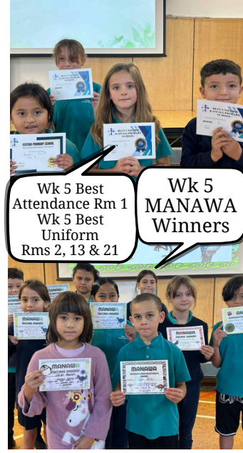
Wk 5 Best Attendance Rm 1 Wk 5 Best Uniform Rms 2, 13 & 21