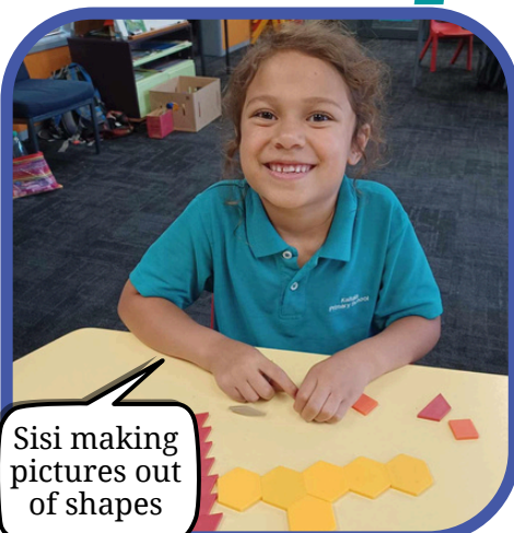
Sisi making pictures out of shapes