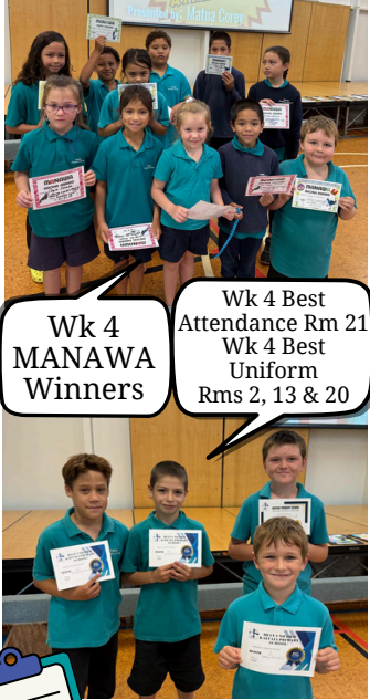
Wk 4 MANAWA Winners