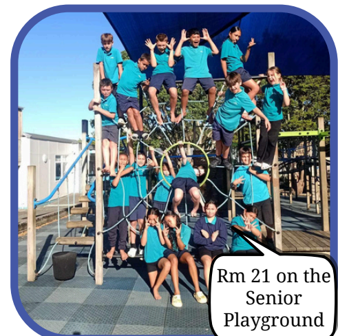
Rm 21 on the Senior Playground