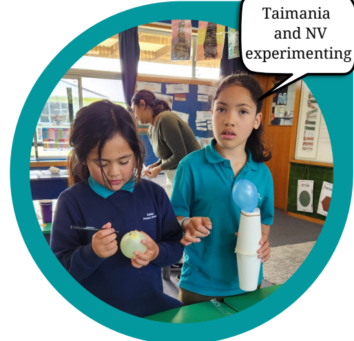
Taimania and NV experimenting