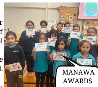
MANAWA AWARDS Week 3