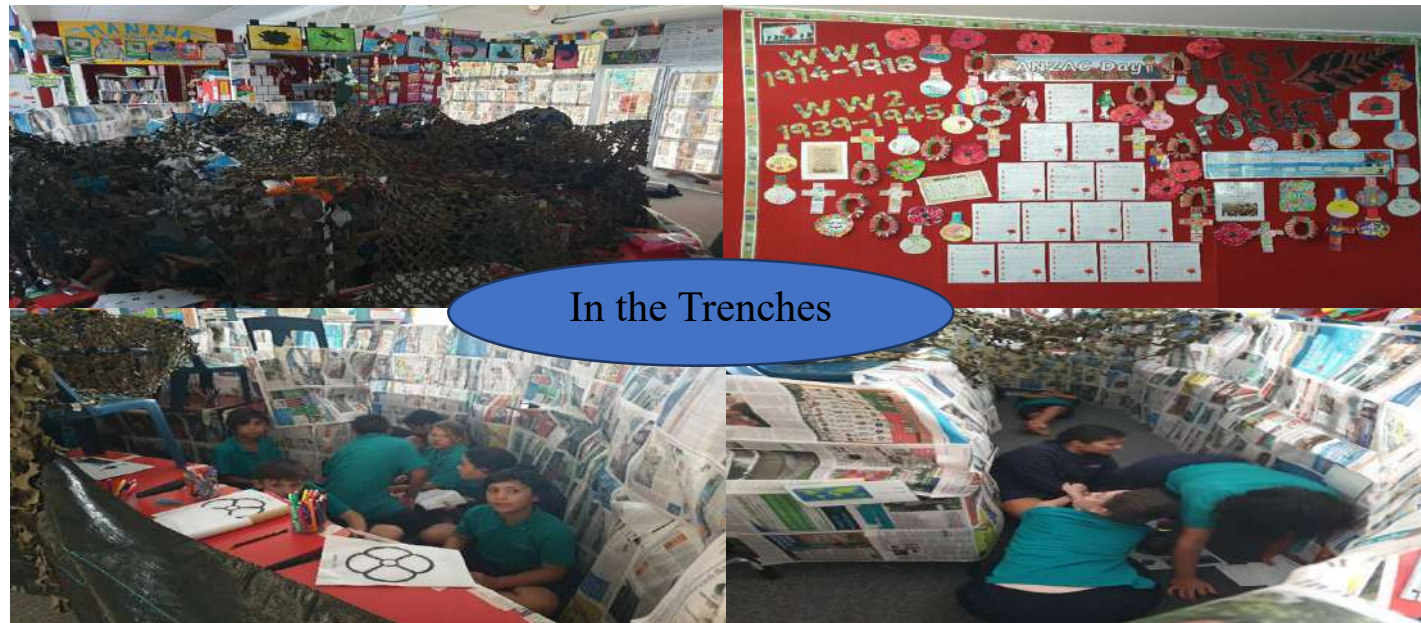
In the Trenches

Please show your support for the following sponsors who have taken time to support us.