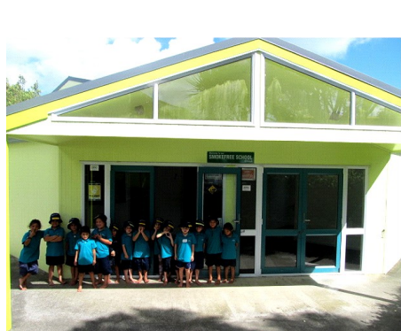
Here we are outside the school hall.....

We decided that since Room 3 children were new at school we would go on a tour of our school and meet all of the other children and see the places that are special to the school.