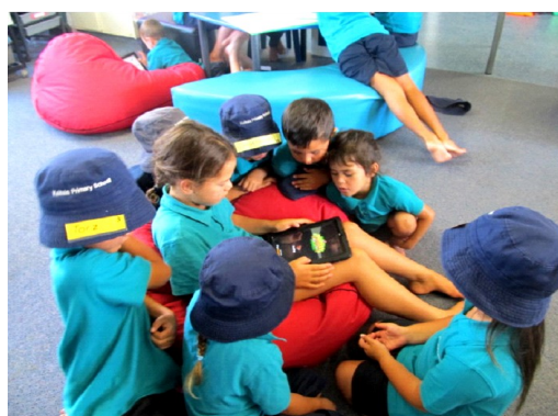
Room 13 showed us their work on their iPads.