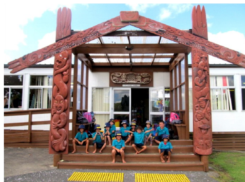
Here we are visiting the Whare Marino.....