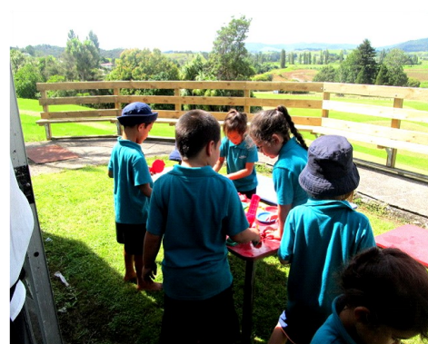
We had some playtime with Room 1.

We wanted to introduce ourselves to the whole school. Room 11 offered to help us with a waiata. They supported us by introducing us at assembly. Thank-you room 11.