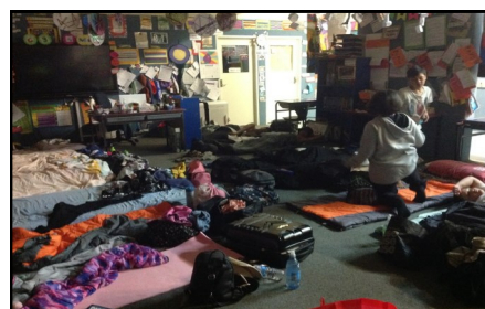
Sleepover in our class.