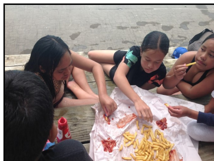
Hot chips and sauce during our last day of camp at the pools!

Here in Room 21 it has been busy, busy, busy! Painting, completing inquiry, finishing off online learning, practicing for our end of year prizegiving to name a few! But the highlight for Room 21 was camp! Below are some of what Room 21 tamariki got up to during camp.. Hope you enjoy!