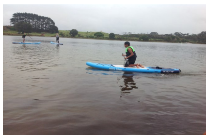
Paddle-boarding was fun!