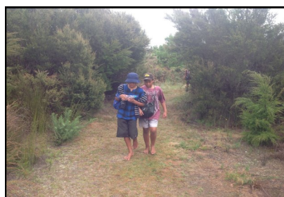
But the walk around Lake Ngatu was not!