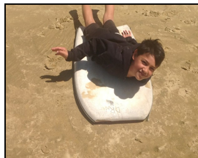
Sand boarding at Te Pahi!