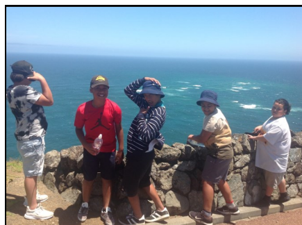
The boys at Kapu Wairua, Cape Reinga